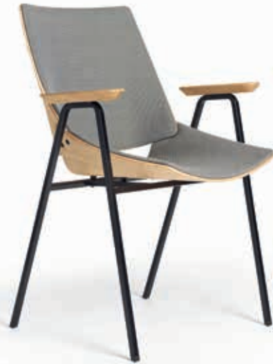
Seat and back upholstery