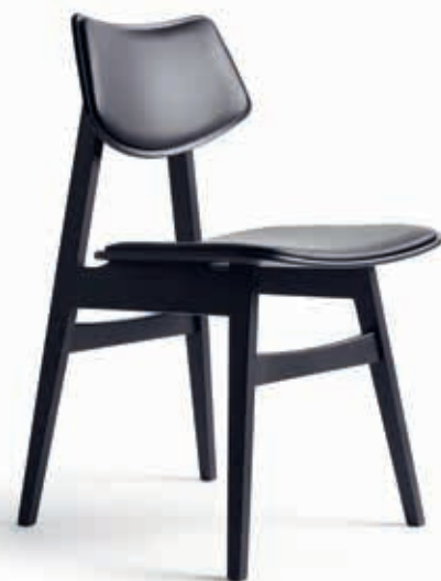
Seat and backrest offset upholstery