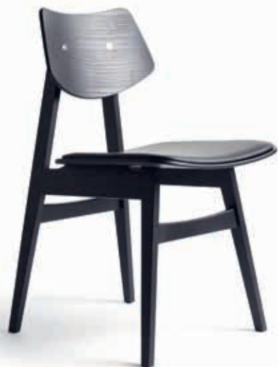
Seat offset upholstery