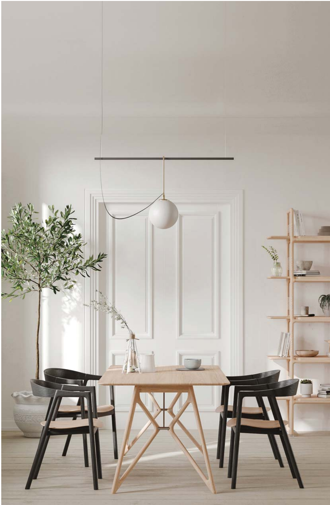
Tink table | Muna chair | Muse room divider