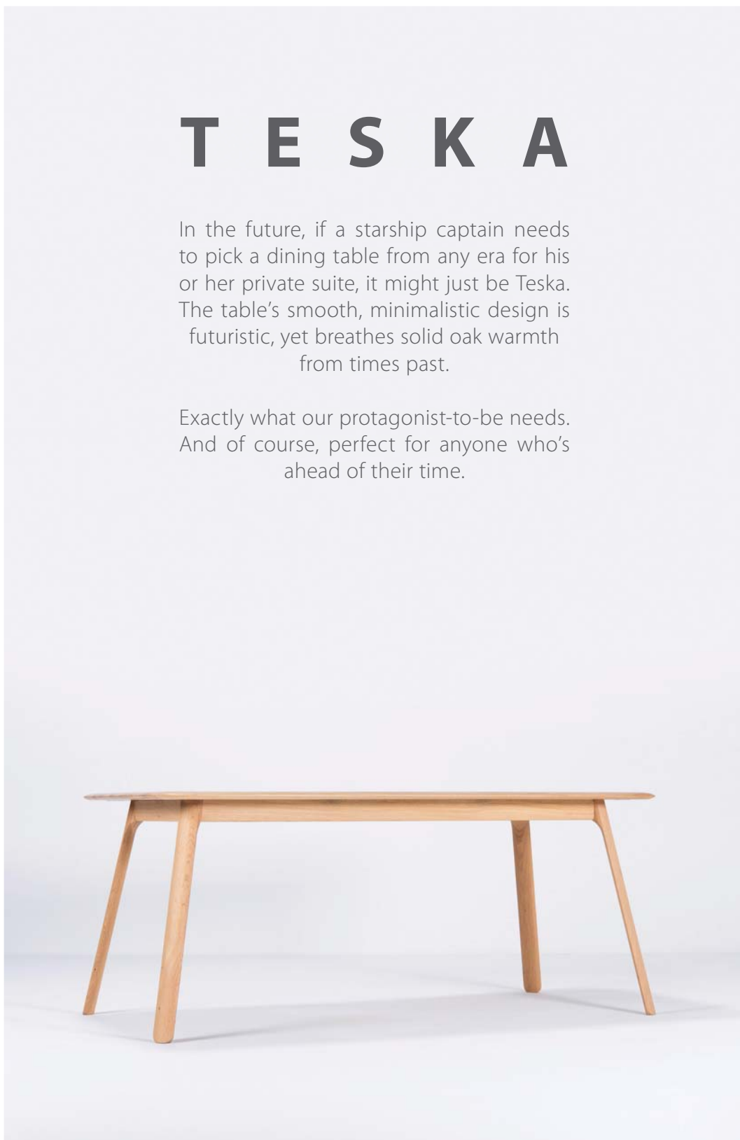
Teska table | Tica

Exactly what our protagonist-to-be needs. And of course, perfect for anyone who's ahead of their time.