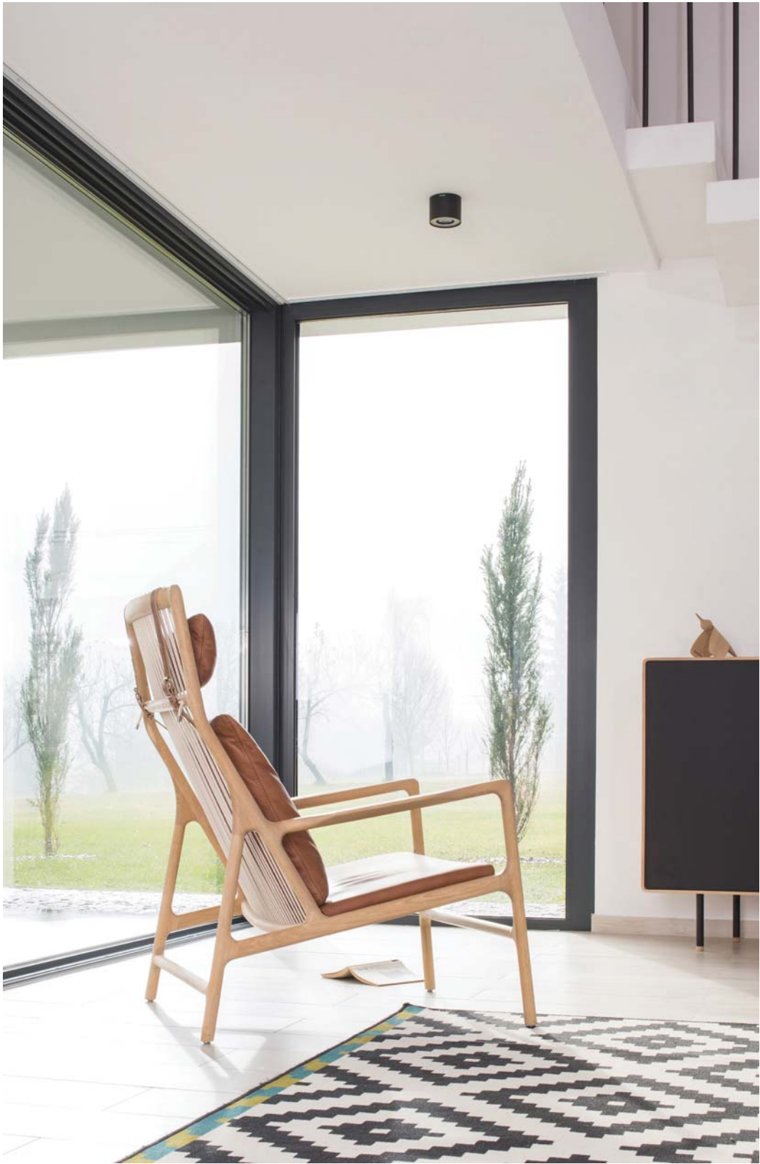
Dedo lounge chair | Fina dresser | Tica