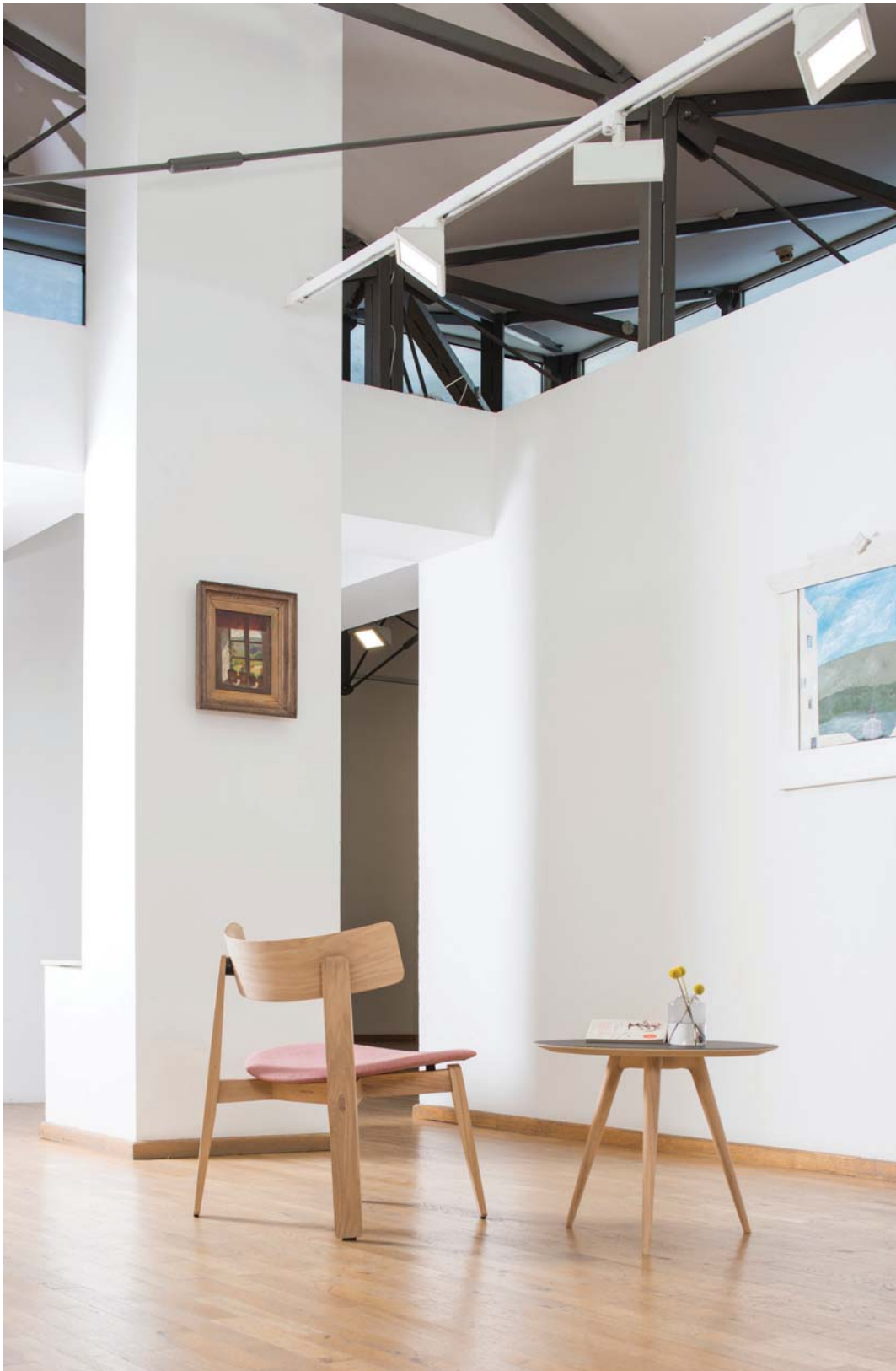
Nora lounge chair | Arp side table | Location: National Gallery B&H