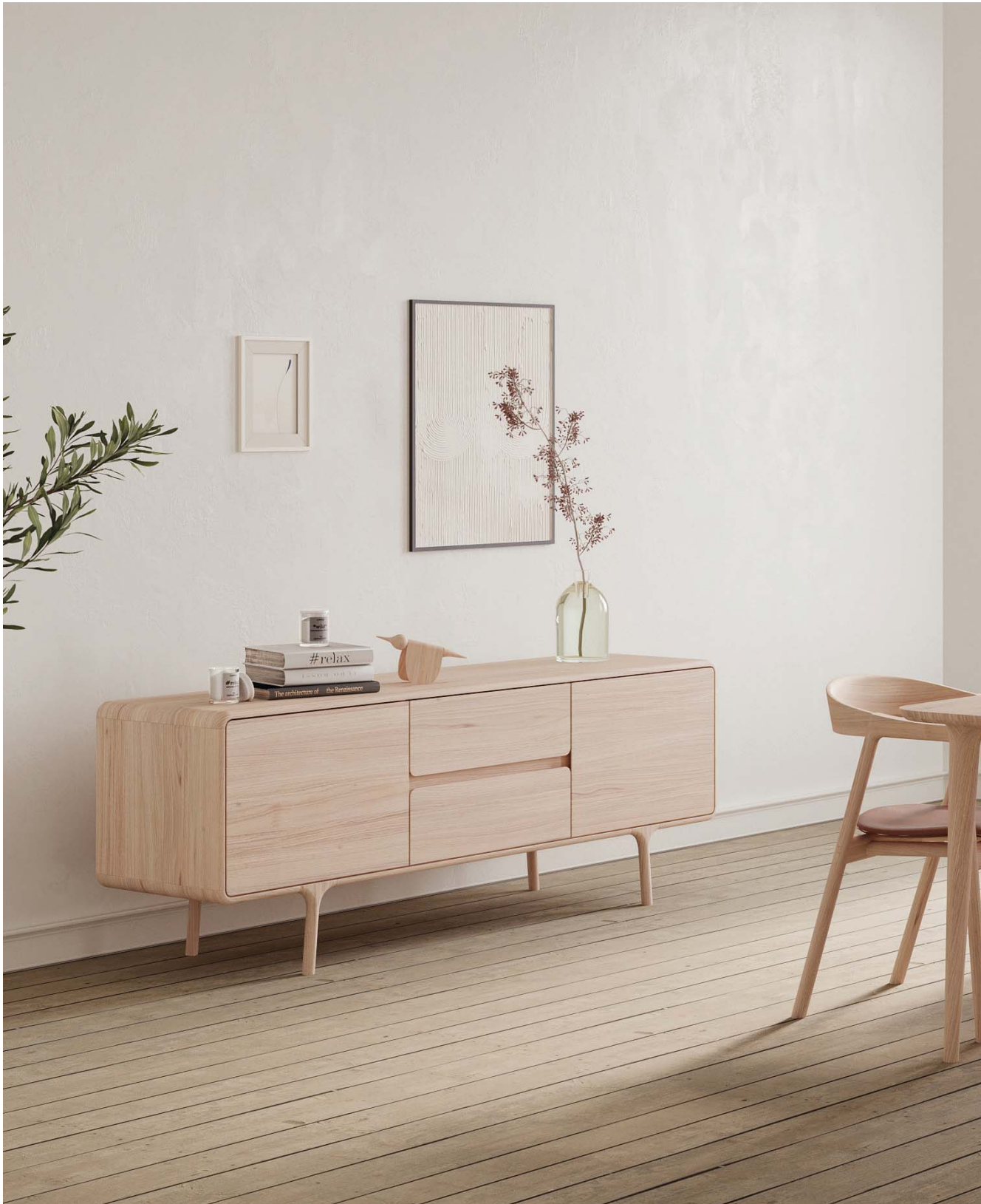
Fawn sideboard | Fawn table | Muna chair