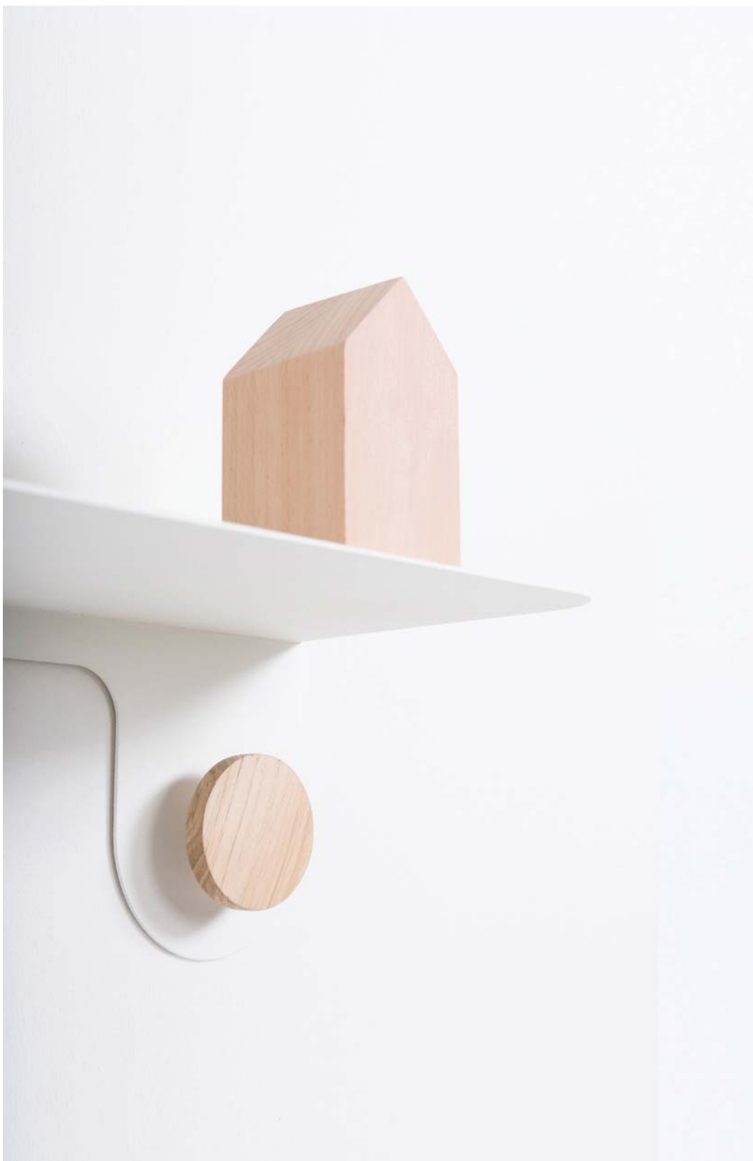
Hook wall shelves | Muna chair | Stafa table