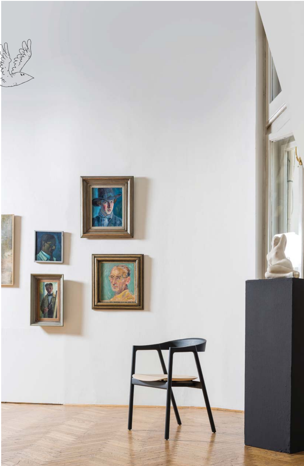
Muna chair | Location: National Gallery B&H