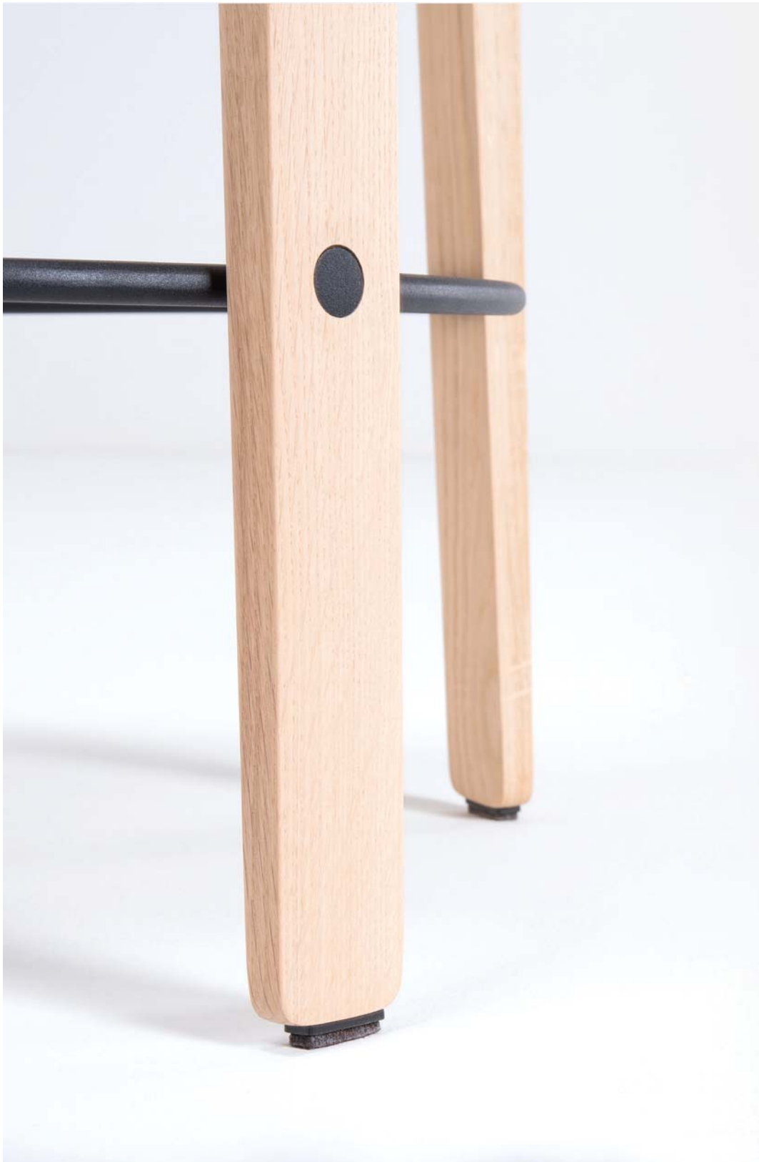
Nora bar chair