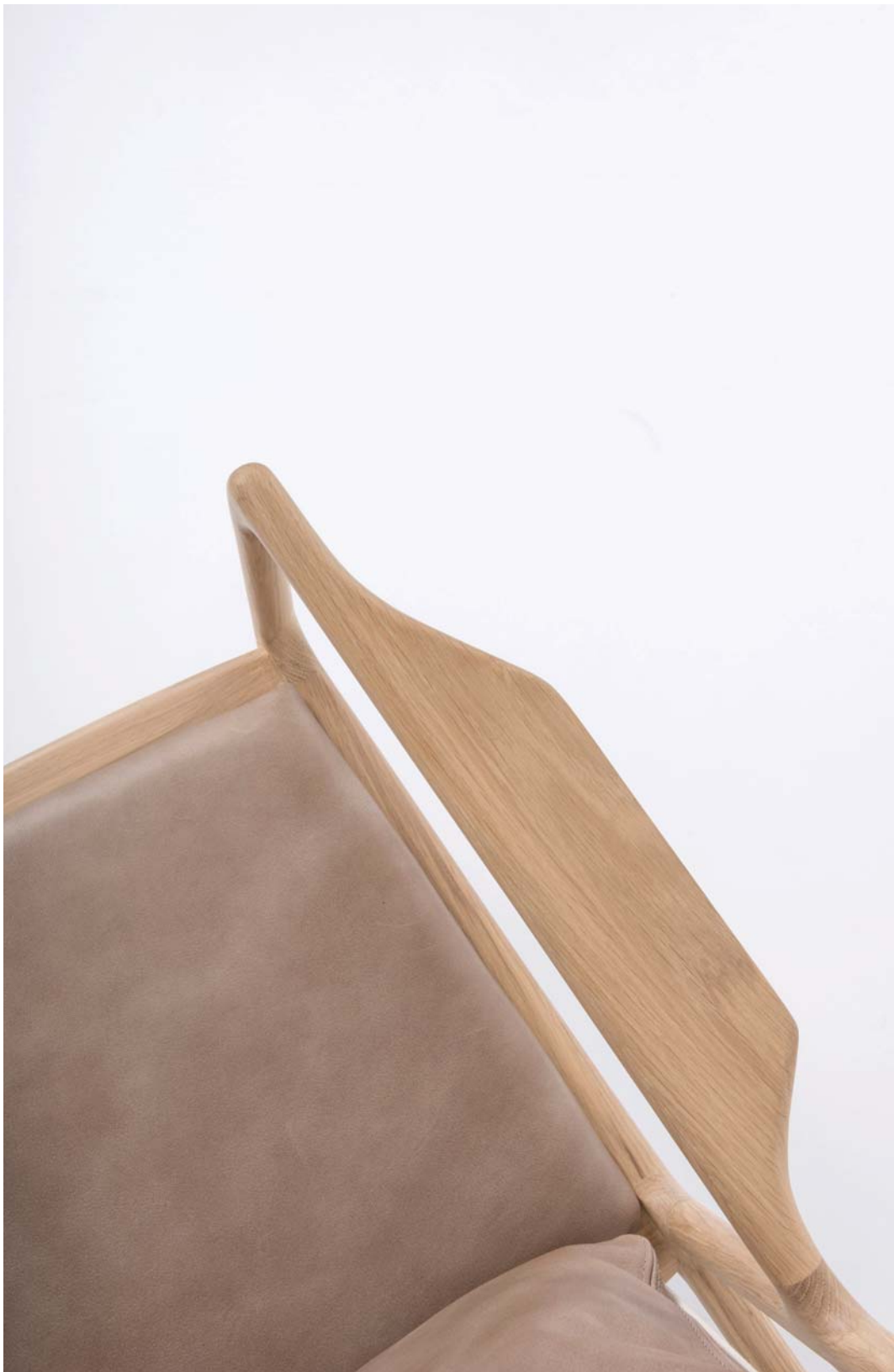
Dedo lounge chair