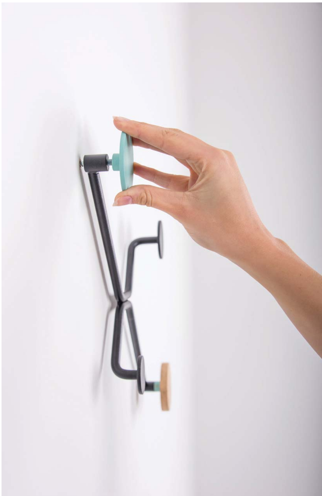
Hook wall coat rack | Hook coat stand