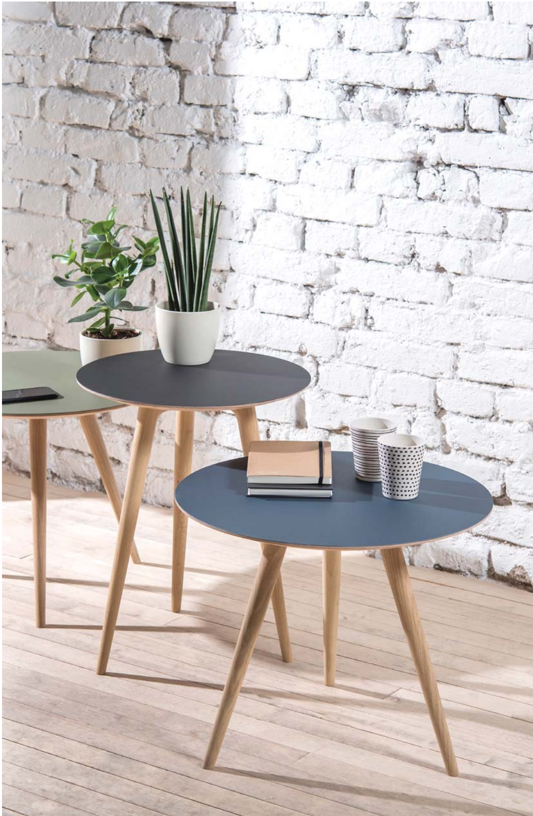
Arp side table