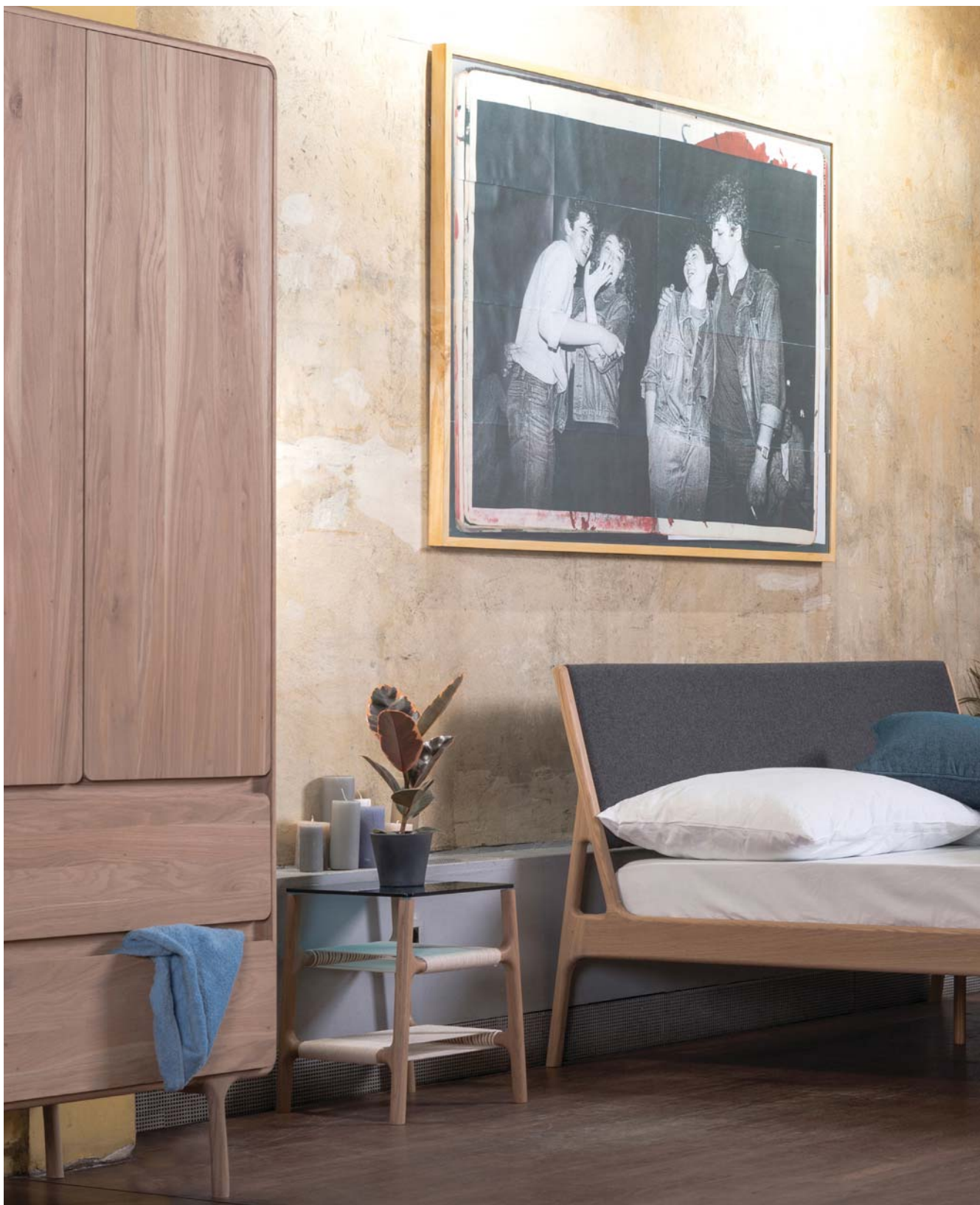
Fawn wardrobe | Fawn side table | Fawn bed | Fawn drawer