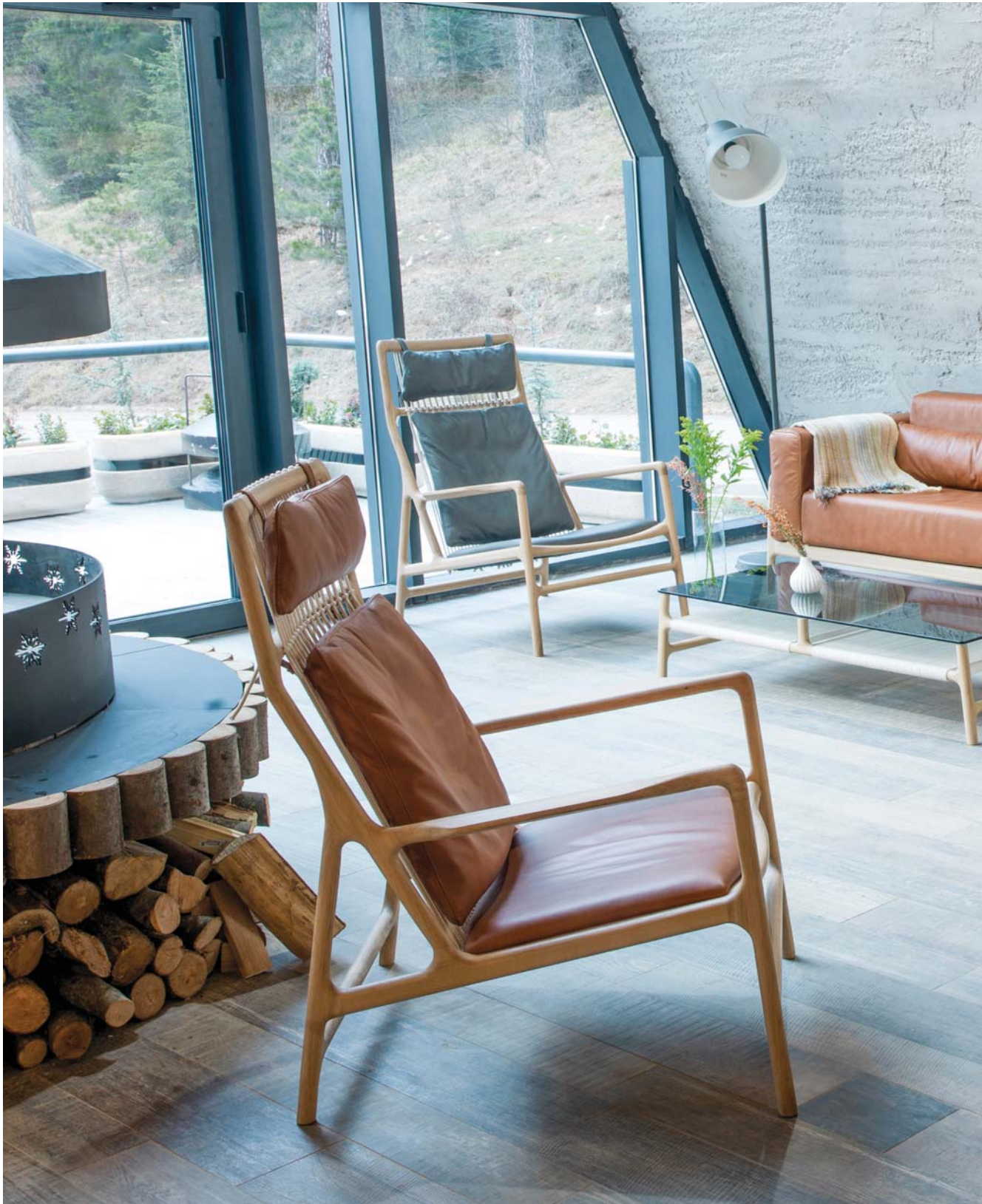
Dedo lounge chair | Dedo footstool | Fawn coffee table | Fawn sofa | Muse room divider